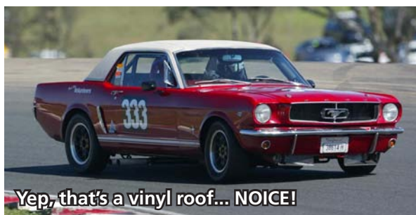
Yep, that's a vinyl roof... NOICE!