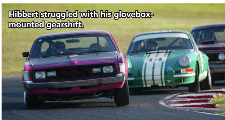
Hibbert struggled with his glovebox-mounted gearshift.

Seton led all the way to notch up the Group A win with Ashwood just beating