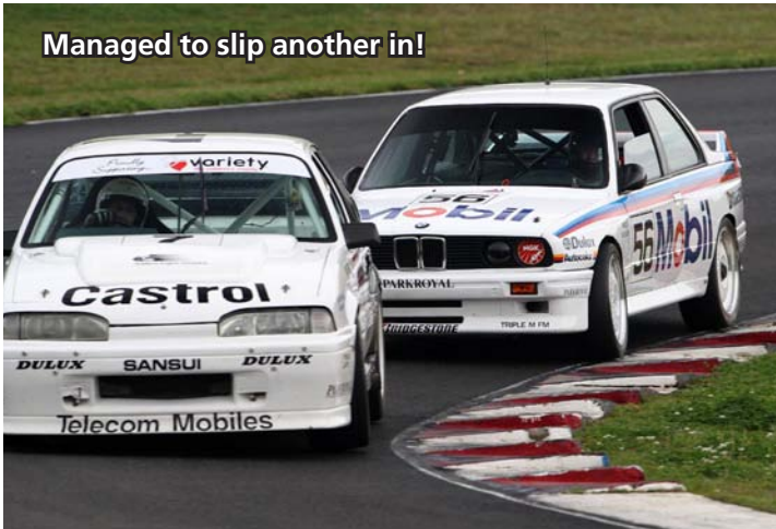
Managed to slip another in!