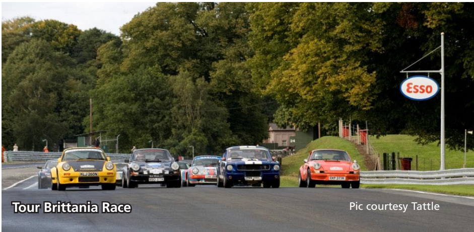
Tour Britannia Race