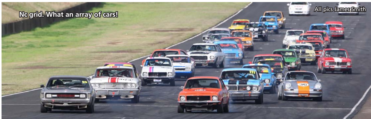
No grid. What an array of cars!