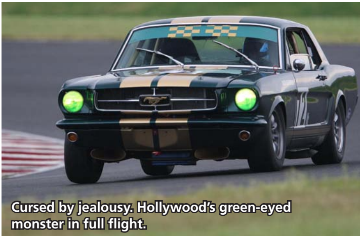
Cursed by jealousy. Hollywood's green-eyed monster in full flight.