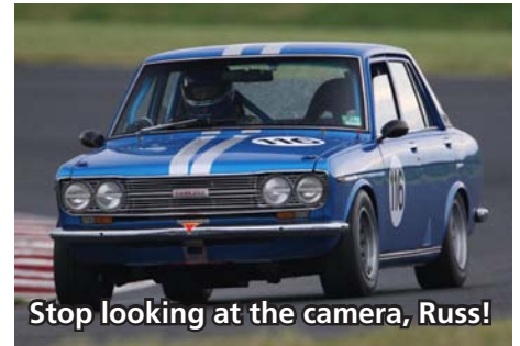
Stop looking at the camera, Russ!

Fleming zoomed to an early lead in race three but then retired with an engine drama, leaving Trengrove and Bryant to stage a great dice for the win. The 'Stang just beat the Sprint at the line with Ulrich next then Toepfer and Waterhouse.