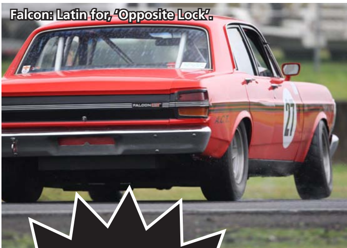
Falcon: Latin for, 'Opposite Lock'.