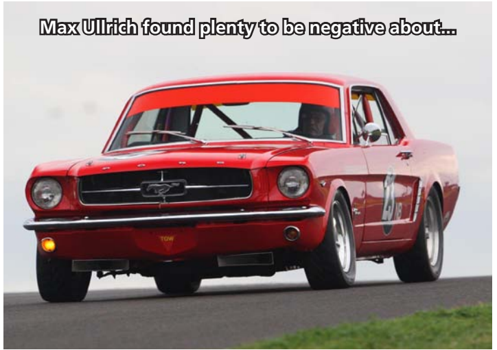
Max Ulrich found plenty to be negative about...