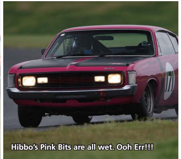
Hibbo's Pink Bits are all wet. Ooh Err!!!