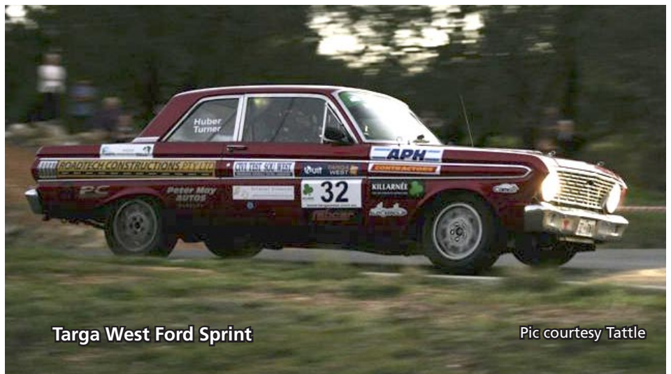
Targa West Ford Sprint