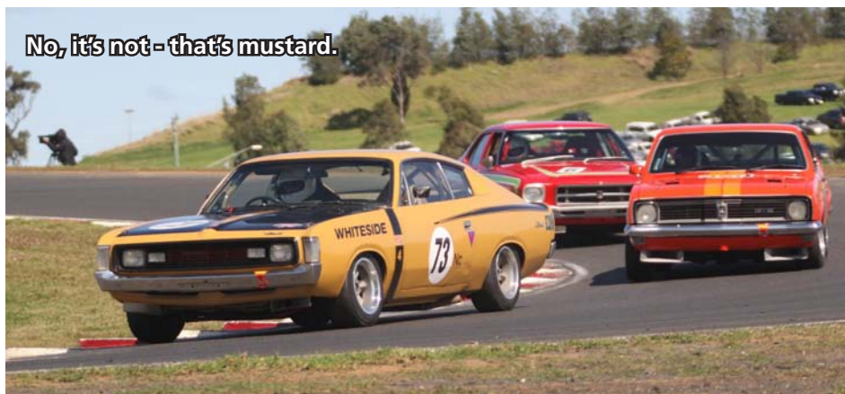
No, it's not - that's mustard.