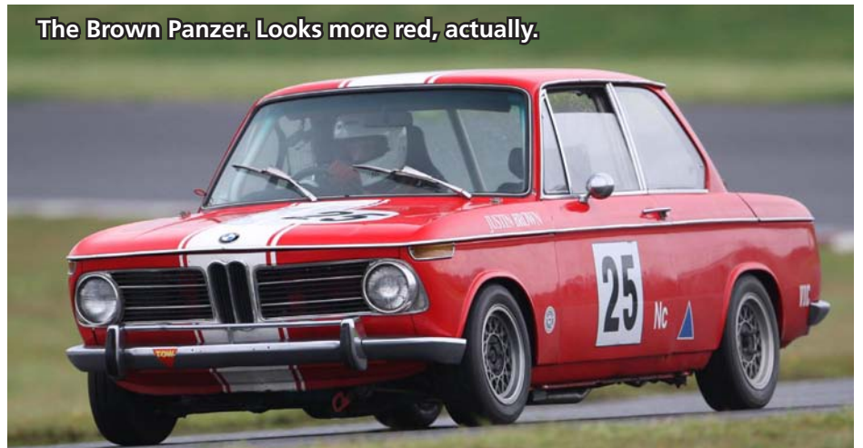
The Brown Panzer. Looks more red, actually.

Wilkinson posted a DNF after running in the top five on the penultimate lap while Greg Tkacz pushed the Studebaker up to eighth after starting 15th. In the feature race Bryant was a little slow off the line with Trengrove taking advantage to slip into the lead. Toepfer climbed up to second then retired as Bryant took up the fight for the lead, setting the fastest lap on the final tour. Trengrove just managed to hold on from Bryant with Ullrich close behind in third followed by Clempson