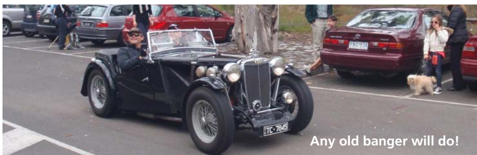
Any old banger will do!

Further regulations may be issued for this event: WATCH THIS SPACE!