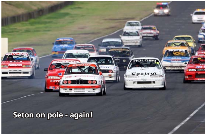
Seton on pole - again!