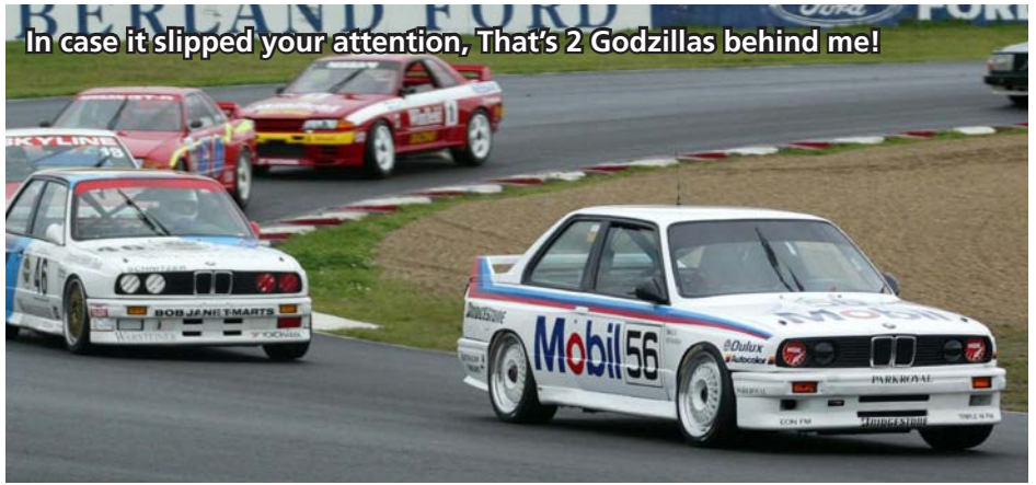
In case it slipped your attention, That's 2 Godzillas behind me!