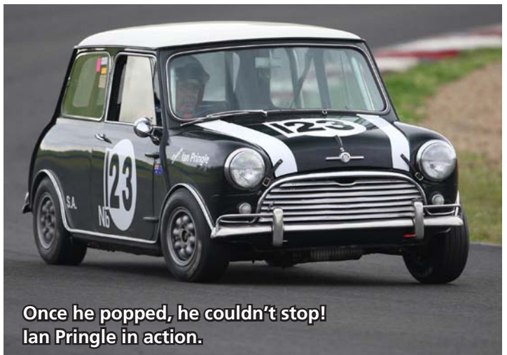
Once he popped, he couldn't stop! Ian Pringle in action.

Great NEW Club Apparel available from Coxy! NOW!