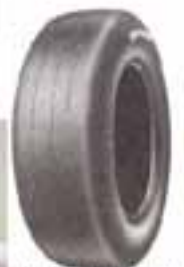
HOOSIER STREET TD

Most sizes available for Gp. N & Gp. S. Call now for this years requirements.