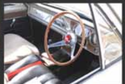
Dyno Dave at a fun Day