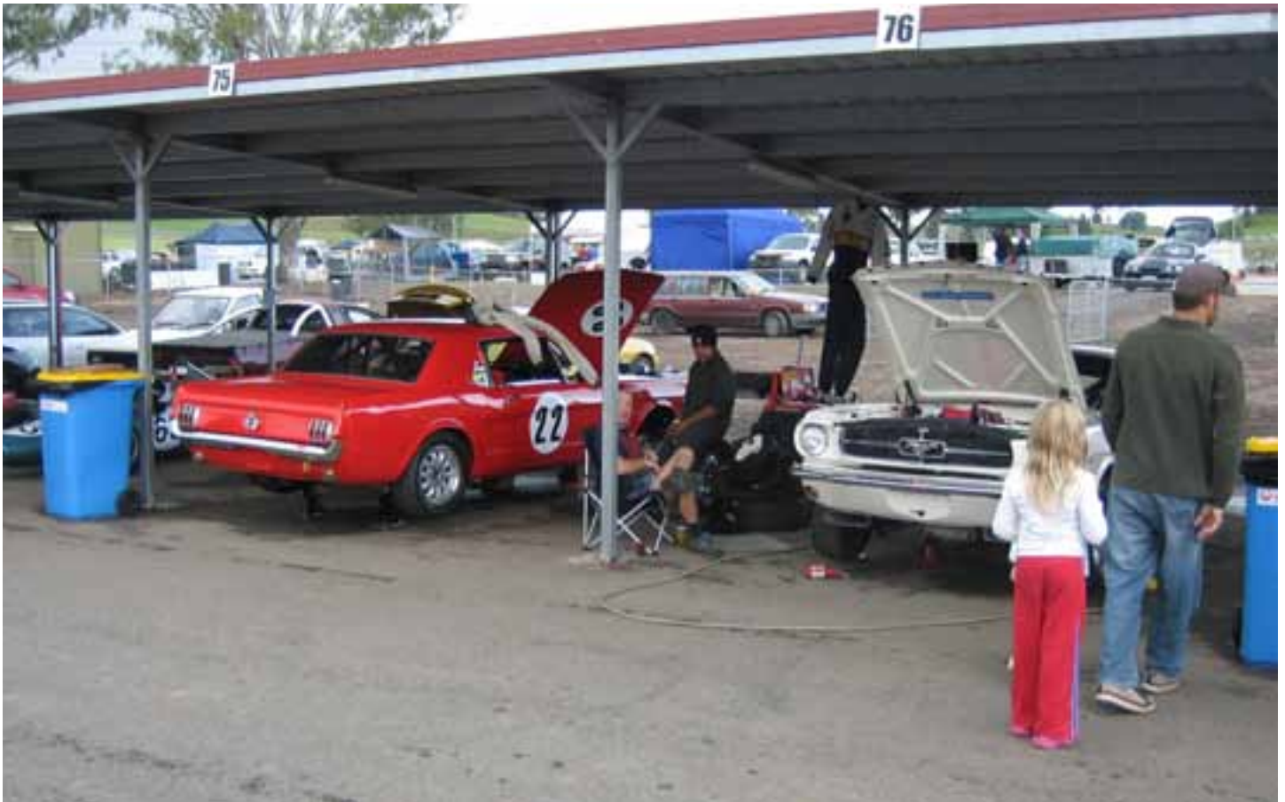
Eastern Creek between races