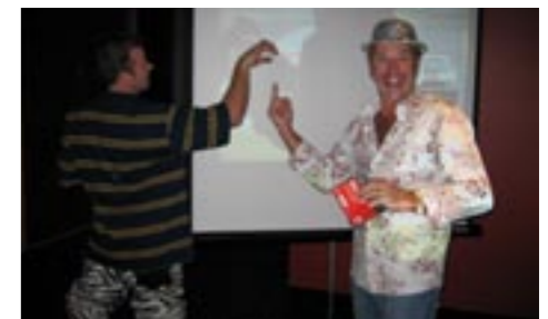
Who ordered clowns?

NEXT GENERAL MEETING Wednesday February 28, 2007